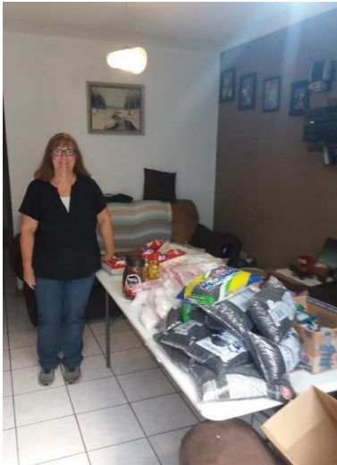
Preparing for food distribution.

We trust you are dealing with the COVID-19 virus and staying safe. Here in Guatemala there have been varying restrictions on our movements to buy essentials. There have been curfews and we are not allowed to meet in groups. We have 1518 confirmed cases of the virus with 29 deaths and 129 people have recuperated.